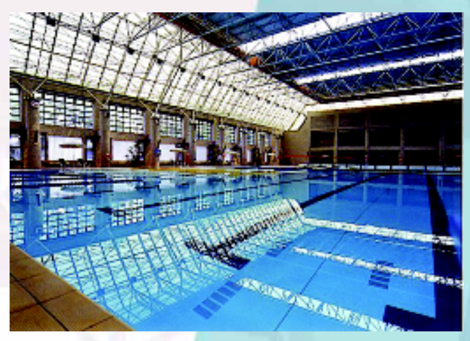
Honorable mention -- "The Swimming Pool"