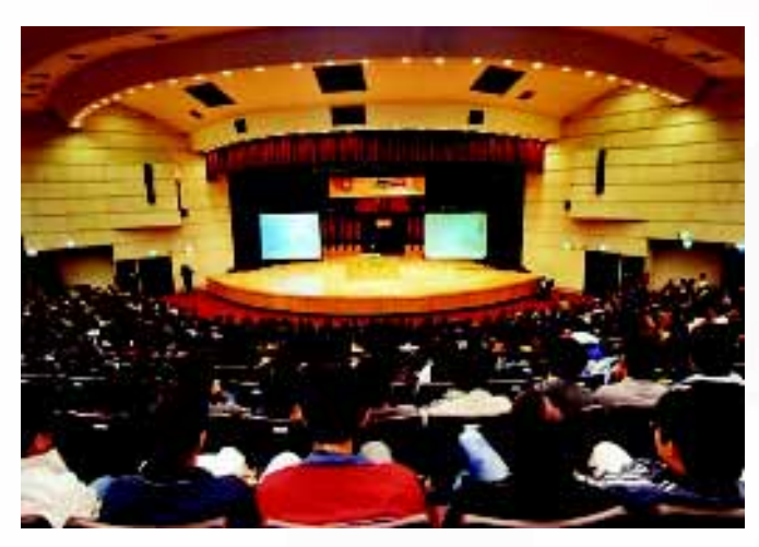
Honorable mention -- "The Auditorium for Commencement"