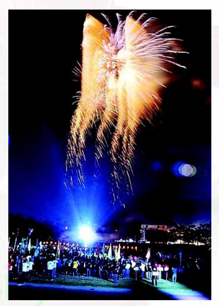
Honorable mention -- "The Splendid Night Inauguration of the Sports Meet"