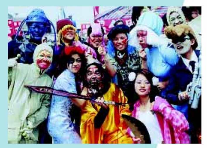
Honorable mention -- "The Costume March of the Department of Visual Communication"

The photos of this year's contest are posted on the Photo Club's webpage at <a href="http://photo.yuntech.edu.tw">http://photo.yuntech.edu.tw</a>. All are welcome to visit the website and view the photos.