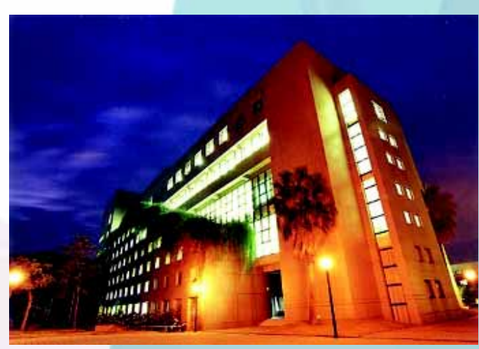
Honorable mention - "The Outward Appearance of the Library"