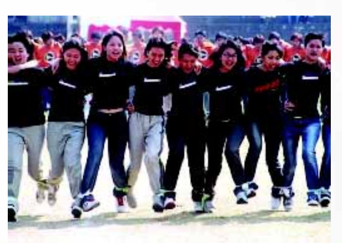
Honorable mention -- "A Team Competition in an Outdoor Bazaar"