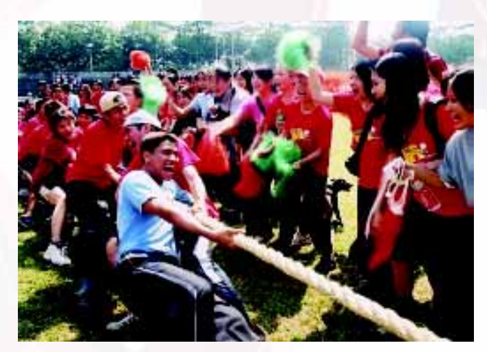
Honorable mention -- "A Tug-of -War in a Sports Meet"