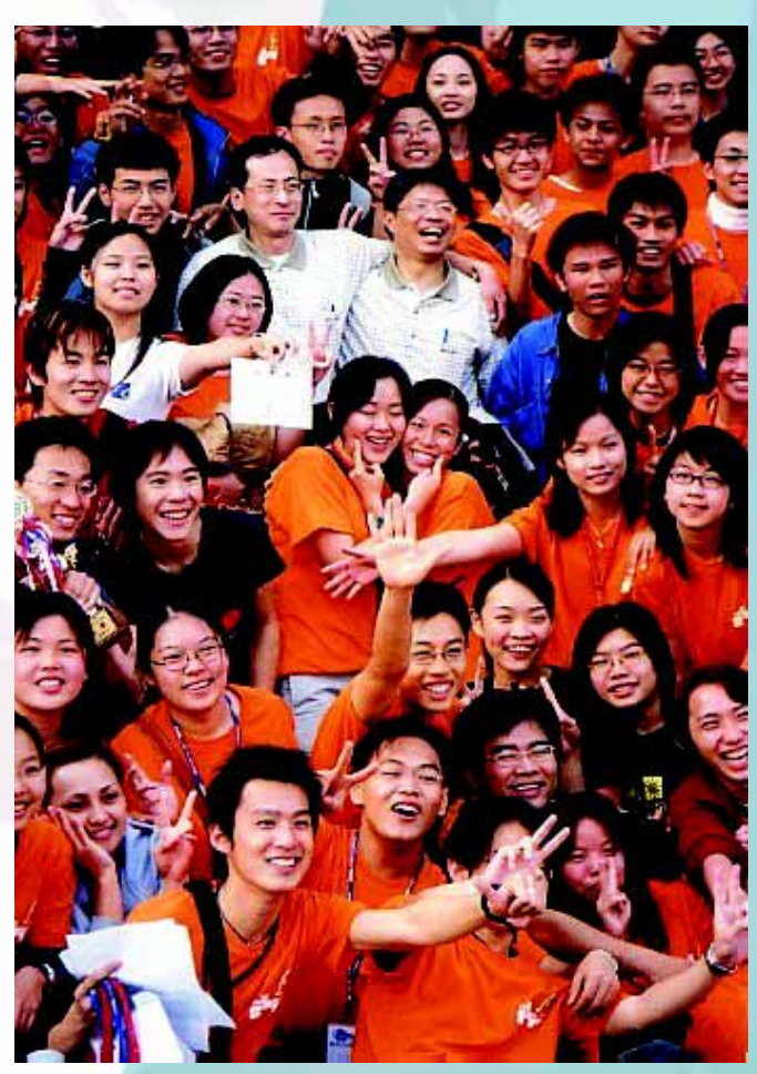
The bronze medal winner

The Photo winning the gold medal was "The New Land Mark of NYUST", taken by Chia-Hung Chen of the Department