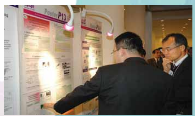
Poster session corner