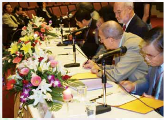
Inking a pact at the 2005 IDC