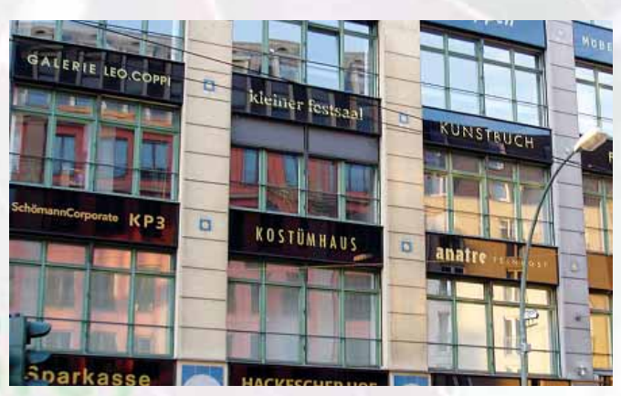
Venue of Berlin film festival