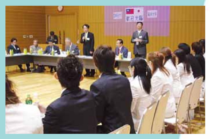
Welcome reception at Fukui University