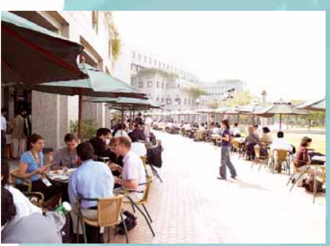
NYUST refreshment area at the 2005 IDC